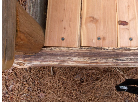
Seat Bottom at Front Detail