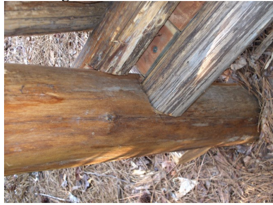
Back Leg Left Detail from Back