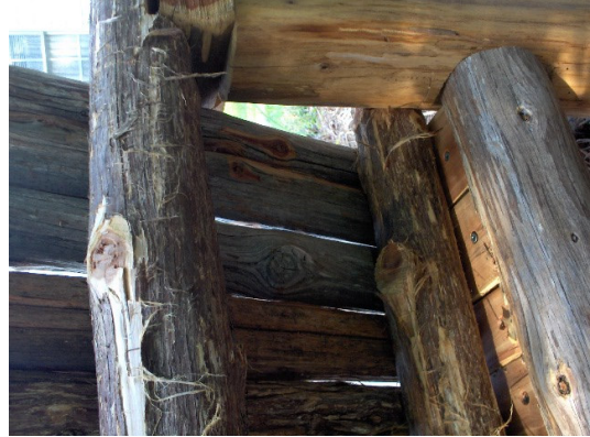
Back Leg Right Detail from Back