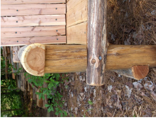
Front Leg Detail Frontview