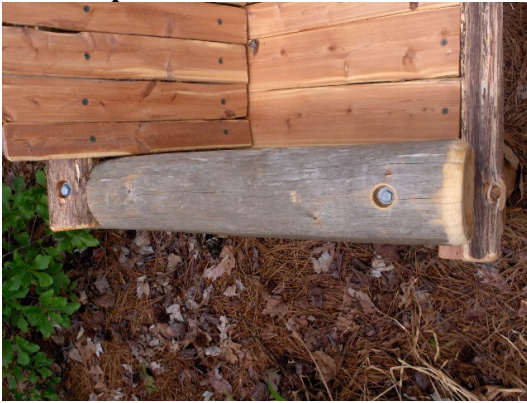
Arm Top Detail