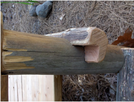
Front leg Detail Sideview