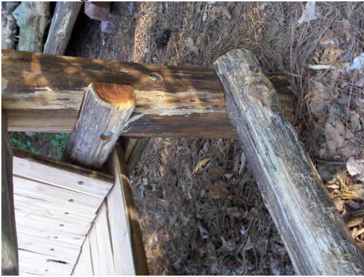
Back Leg Detail General Lower View