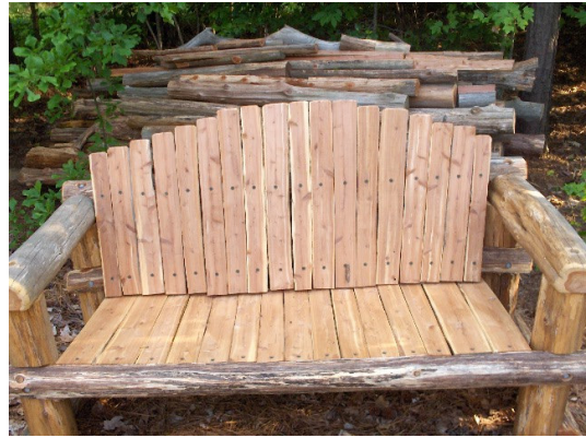
Rustic Cedar Bench