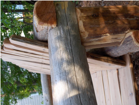
Back Leg Detail General Top View