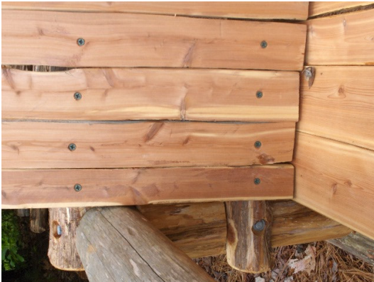
Seat Back Detail